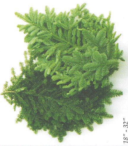
18" - 32"

Noble Fir is a beautiful bough with blue cast. Silver Fir is a rich deep green with silver underside. Harvested from the high mountains.