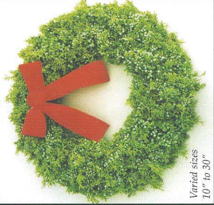
Varied sizes 10" to 30"

Blue berried Oregon Juniper makes a refreshingly different wreath. Exceptionally long lasting.