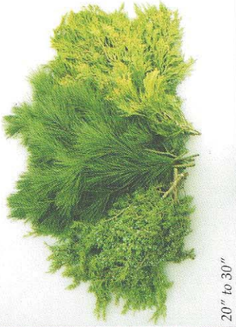
20" to 30"

Princess Pine is a rich green needle that casts silver blue. Long lasting Juniper is outstanding for its fragrance, and is decked with silver/blue berries. Incense Cedar trimmed with small yellow buds has a very pleasant aroma.